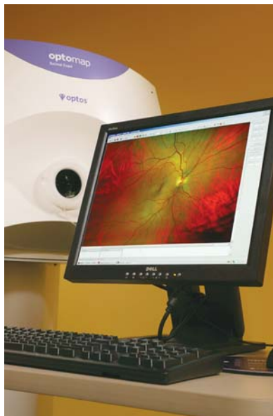
optomap® Retinal Exam

The Optomap® exam is simple: at the push of a button, we can generate a computer image of your retina for immediate review. Experience with this technology has already led to improved disease detection and has possibly prevented vision loss and blindness in patients. We can discuss this revolutionary exam with you further at your next appointment. We look forward to seeing you during your next visit – and providing the most comprehensive and advanced vision care available. ▢